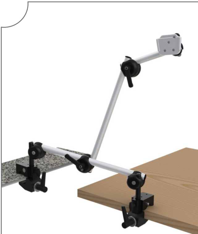
Functional description of locking lever