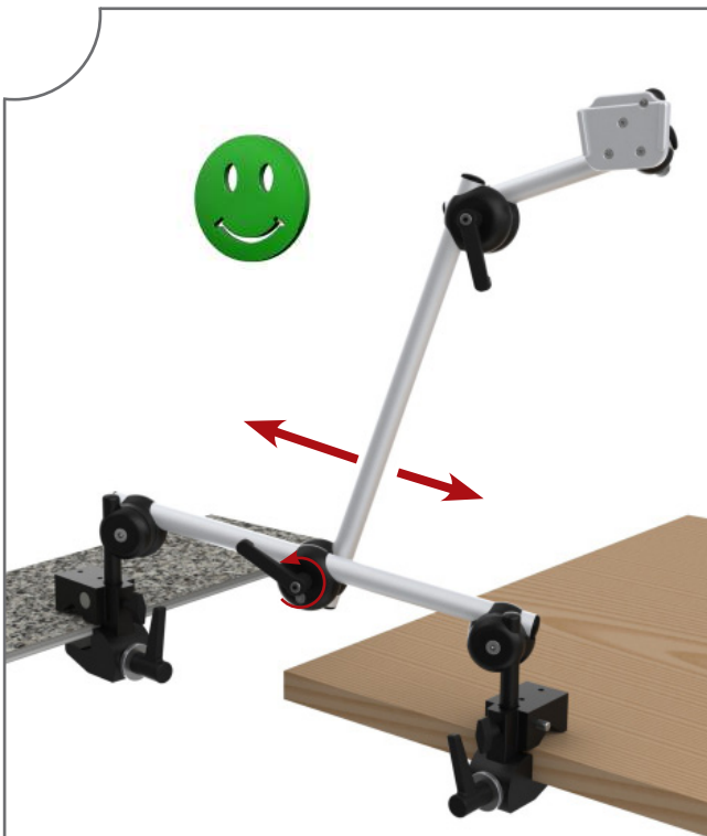
Loosen the lever to adjust vertical tube, it is then possible to move the vertical tube to the left or right.