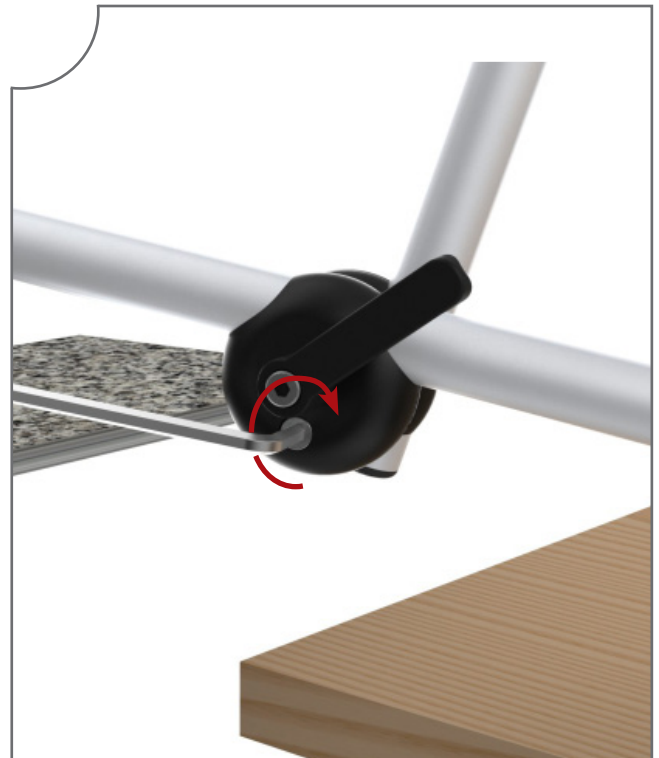
Tighten screw in order to secure the front part of the tube-coupling